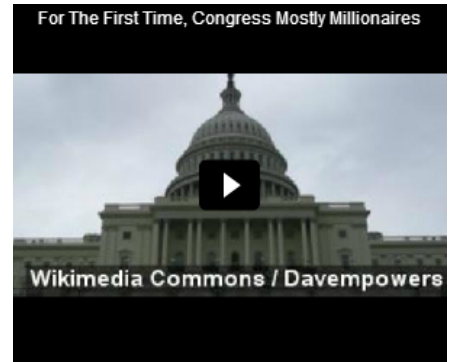
For The First Time, Congress Mostly Millionaires

After being chosen to redesign the World Trade Center site in February 2003, architect Daniel Libeskind declared, "Soon, the Lower Manhattan skyline will be home once again to towering