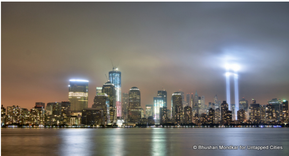
View from New Jersey during Tribute in Light. Also see our behind the scenes of the illumination of this event.