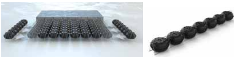
Fig. 1: Voided concrete slab system (illustrations courtesy of CobiaUSA, Inc.)

Voided reduce the slab self-weight, cross-sectional area, and section modulus. The reduction in self-weight allows a proportionate reduction in PT material quantities. Further, the reduction in cross-sectional area results in increased precompression stresses (assuming the same tendon layout and stressing), and the reduction in the section modulus results in a