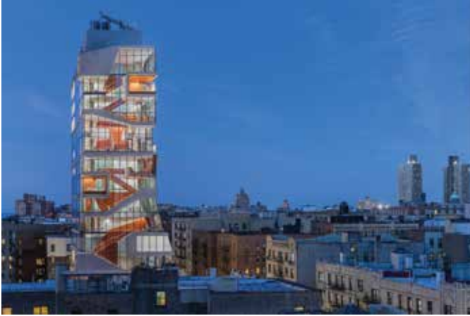
Fig. 2: The CUIMC Roy and Diana Vagelos Education Center