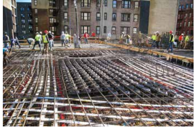
Fig. 3: Construction of a voided slab with two-way banded and bonded tendons

stress profile with increased bending stresses. The increase in precompression typically overcompensates for the increase in tensile bending stresses, so the net result is fewer tensile stresses in the voided slab than in the solid slab. Obviously, if the maximum stresses occur where there are no voids, this secondary benefit cannot be realized.