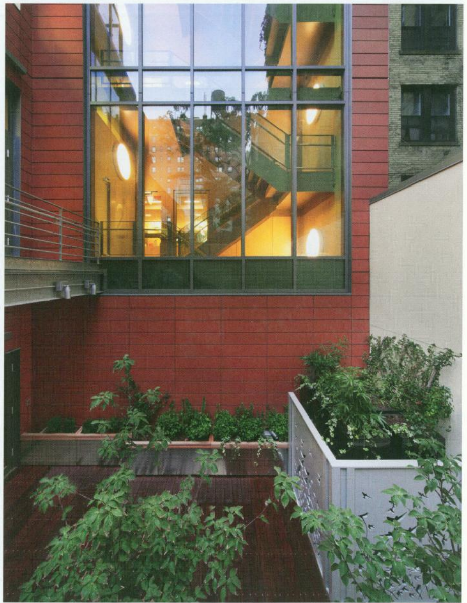
Above The school's interior courtyard lends to its serene learning environment.