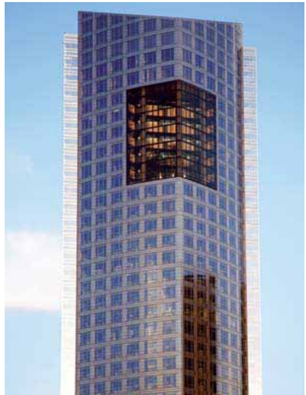
Top: View in context from south